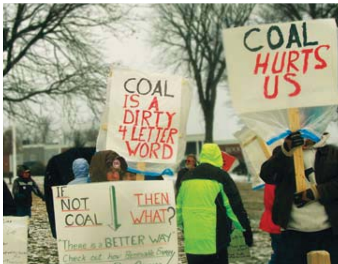
A protest against the coal-burning Brayton power station, Somerset, Massachusetts, March 2009.

While it is easy to feel overwhelmed by the challenge of climate change or tempted by the lure of new technologies and complex policy fixes, it is important to remember that one of the most powerful parts of the problem is also one of the most powerful parts of the solution. In order to make a significant impact on climate, we must stop coal. @